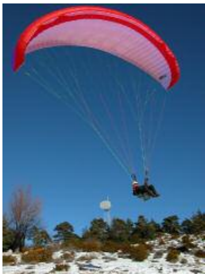
Not actual glider